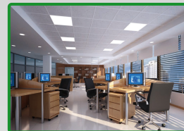
Time Attendance: Office