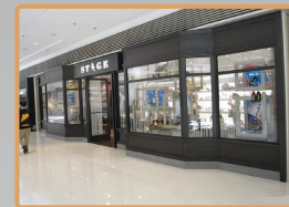
Standalone Access Control: Shop