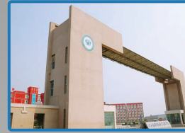
Networked Security: School