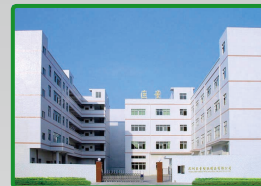
Time Attendance: Factory