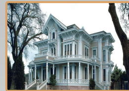
Standalone Access Control: House