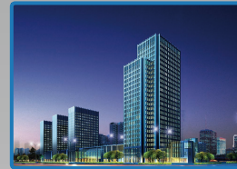
Networked Security: Building